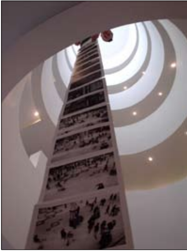
600 Images in London at the Great Eastern Hotel, June 2005.