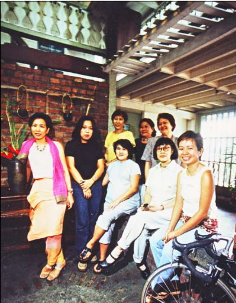
Participating artists in Walong Filipina 2001: Sa Ngalan ng Kalikasan II are mostly Kasibulan members.