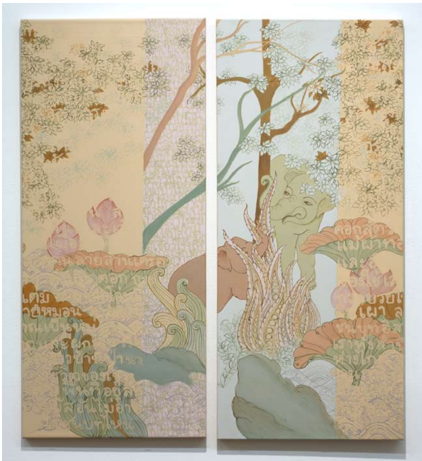
One is All . 2007. Acrylic on canvas, 40x90cm.

trees to which my free hand drawing always led. The physical conflict I went through calculating the isometric forms and perspective of the Australian house in my next work An Elephant Journey , was in fact shaped by the pace of learning about the new space I live in. The work however was read by one curator as a 'cross cultural' product, perhaps with an identity crisis, and her interpretation focused on what she called 'the wrongnes,' 'the mismatch,' and 'the wrong sense of perspective' in the representation. The language of Thai mural painting in the work was only the language of naivete in the empirical sense. The series was part of the exhibition Abstractions held in Canberra in 2003. A member of the audience approached me at the opening and said that my painting was most exquisite with details, but I had to tell him the stories because he had no idea what they were about. I wanted to say there was no story to tell in my work concerning Australian subject matter and that was the point, but he did not wait for the answer. Perhaps he did not want to know after all.