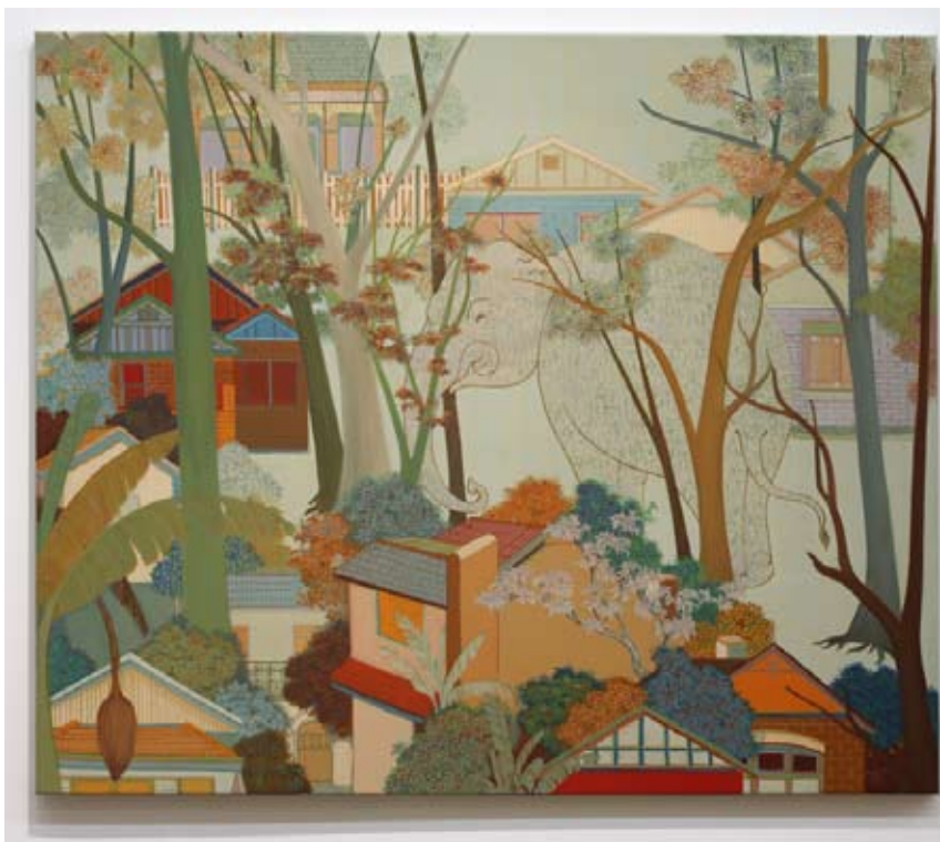
Where there is No One..there is No Two , 2006. Acrylic on canvas, 100x120cm,

mural projects earlier in Thailand. The story had now turned into a personal one. Meanwhile Australian trees and flowers and more recently Australian houses started to appear in my painting. I anticipated I would paint figures, but my first approach to Australian subjects had led to the disappearance of human figures, as if there was something missing from my own words. The pictorial narration of Australia has been the telling of the story of the void. The connection to my new world was only my own echo. The Mermaid who, in order to connect to the human world, sacrificed her own voice to enter into the new one, bore a dilemma, which I confronted.