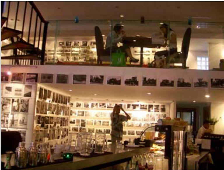
600 Images in Bangkok at Gallery F Stop, Tamarind Café, June 2005.