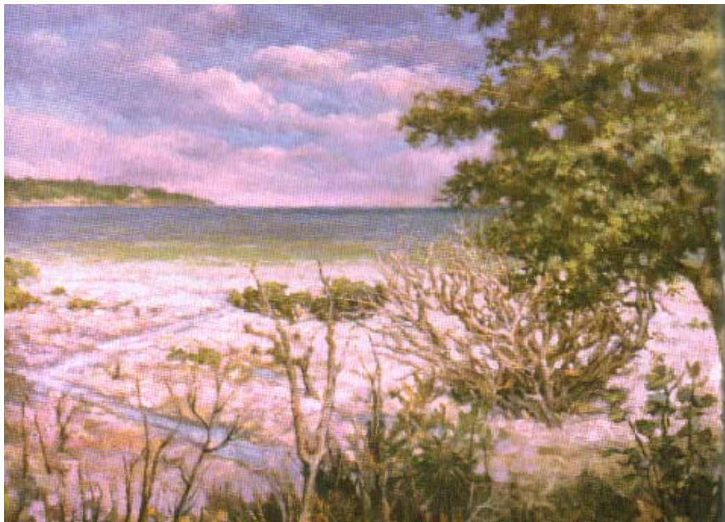
Hain na ang Pagatpatan? , 1998. Oil on canvas. 76.5 x 89 cm.