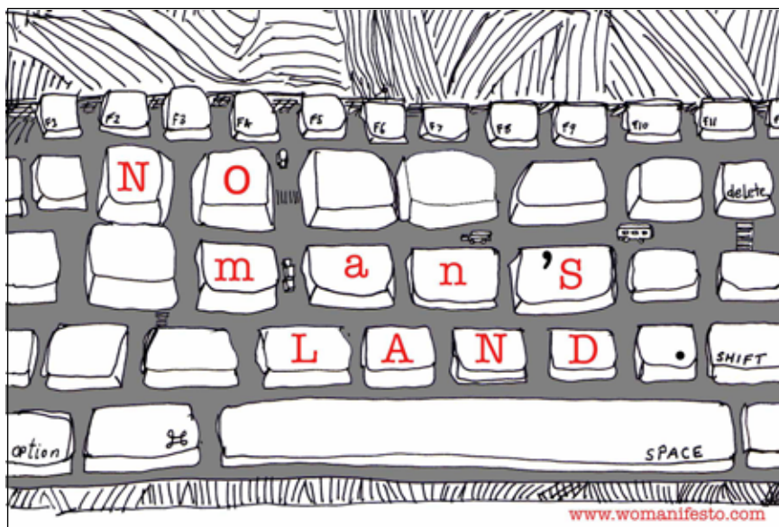
Front face of the postcard-invitation announcing the URL of No Man's Land : http://www.womanifesto.com/en/events.asp

of the participants were previously unknown to me. And over eighty-eight contributions are included in the box. The call for participation for the project and dissemination of the result was widely publicized via personal email lists and web postings; and most of the works were received via email from various parts of the globe. In the same year, a website to showcase our activities was also established.